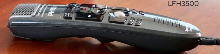
Philips SpeechMike Premium Dictation Microphone LFH3500